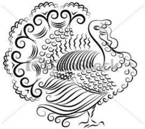
© Can Stock Photo - csp6544499