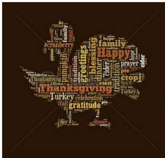
© Can Stock Photo - csp32022754